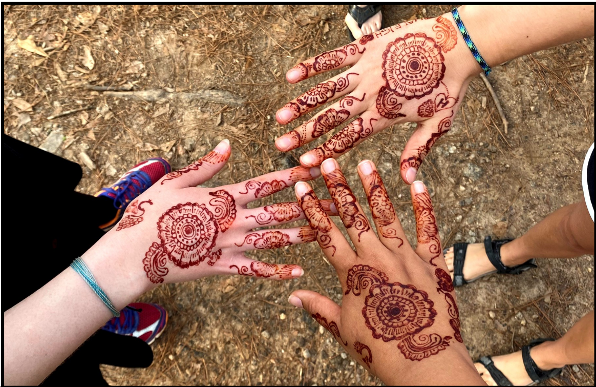
Our Afghan guests have popularized the Eastern art form of henna at Jubilee this spring!