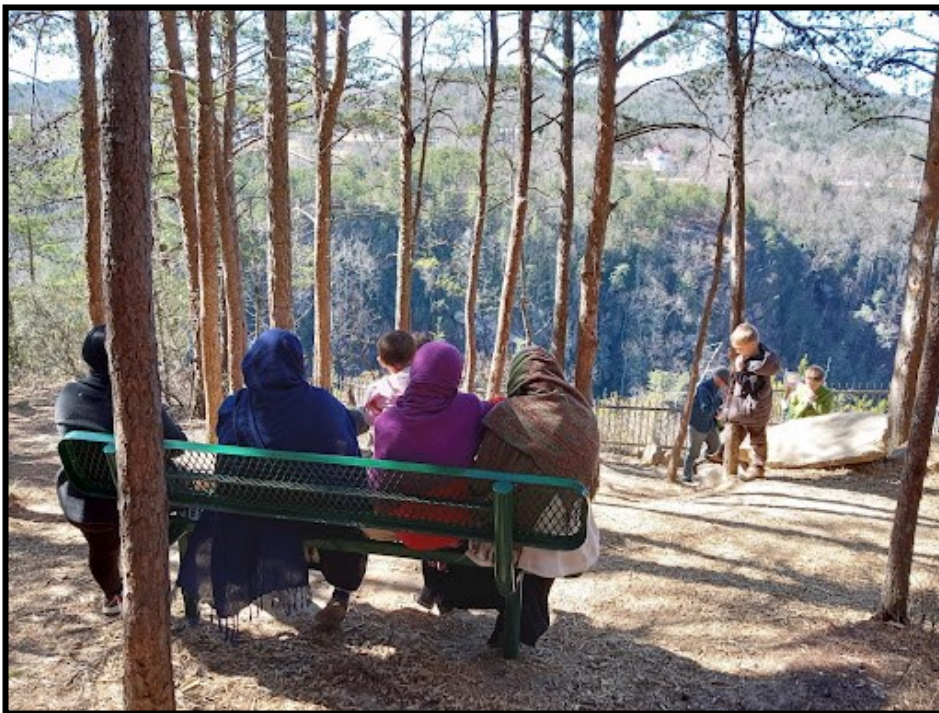
The families enjoy the view on an outing to Tallulah Falls.