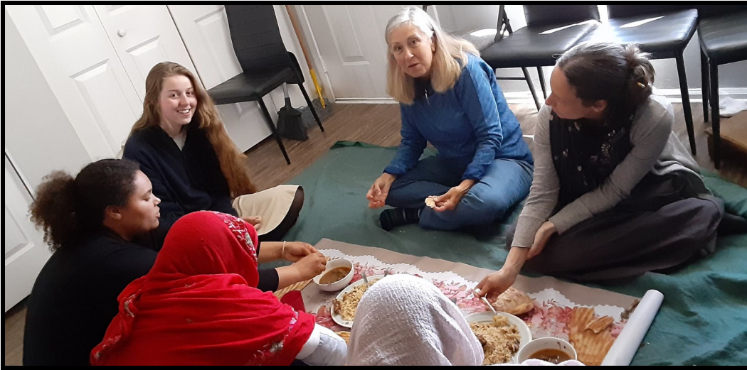
The women sit down together to share a meal.